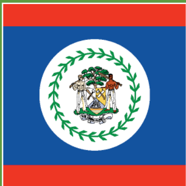
ABOVE: The Belize Flag