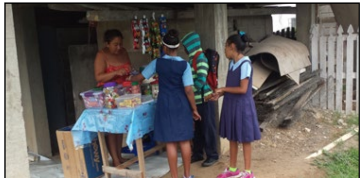
Local entrepreneur selling items to schoolchildren