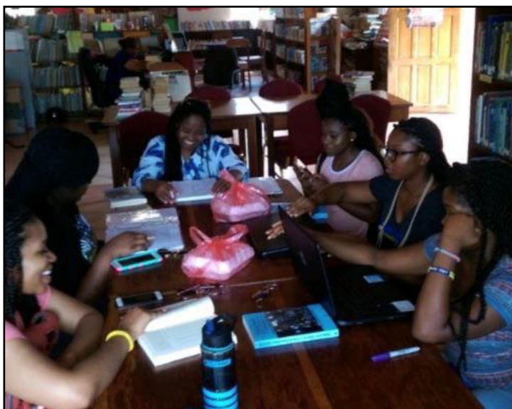
Class Session at Local Library