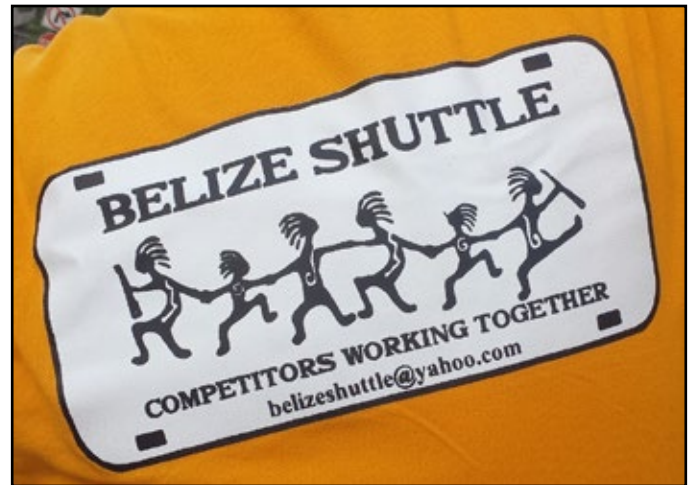
Competition is good for the economy as encouraged by this local entrepreneur.